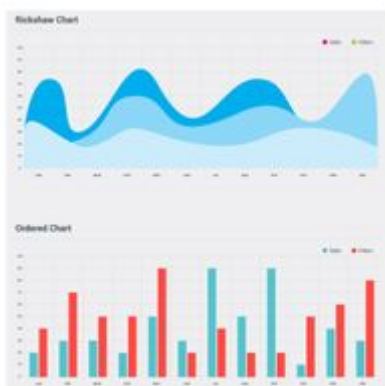
Figure 1. Demonstration content for layout testing

The figure above is an example image included to demonstrate how the template handles image placement, captioning, and scaling. In your own document, you would replace this with your actual charts, graphs, photographs, or other visual materials. The template automatically numbers figures and positions them according to the layout rules.